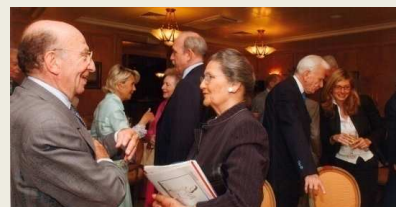
The inaugural dinner of the Committee of Honour of membership headed by Pierre Messmer (Latin cross) and Pierre Mazeaud, bringing together personalities such as Simone Veil, Yves Guéna, Pierre Mauroy and Michel Rocard...

In order to finance its contribution to the investment of the project (20%), the Foundation has undertaken fundraising with large sponsors (foundations, businesses, local authorities).